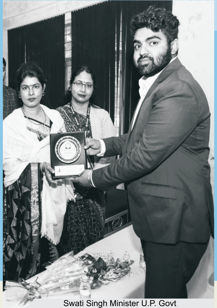
Swati Singh Minister U.P. Govt