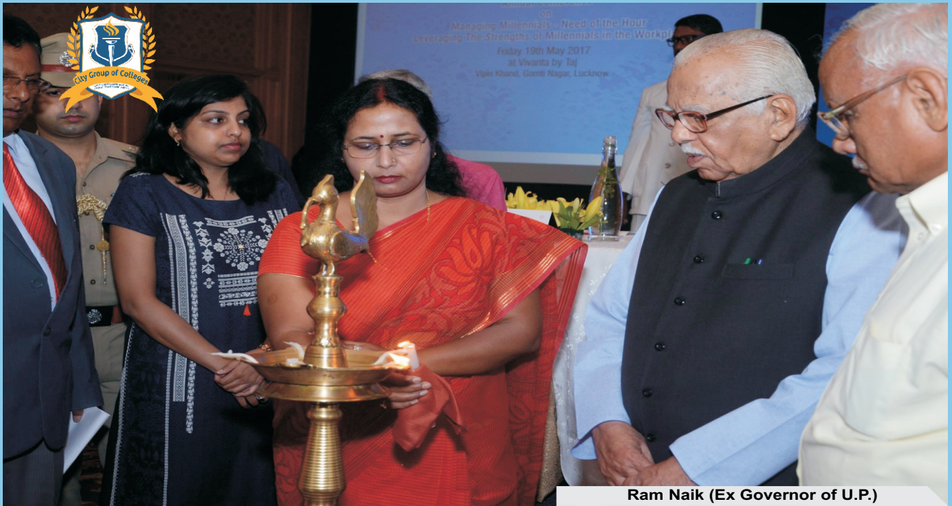
Ram Naik (Ex Governor of U.P.)