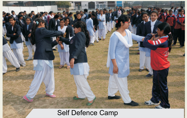
Self Defence Camp