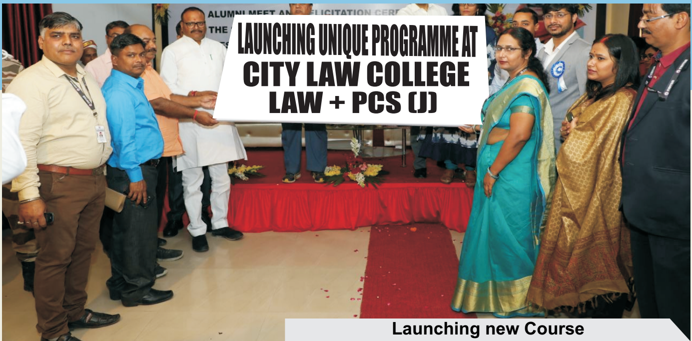
Launching new Course