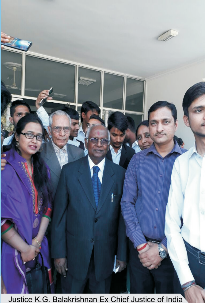
Justice K.G. Balakrishnan Ex Chief Justice of India