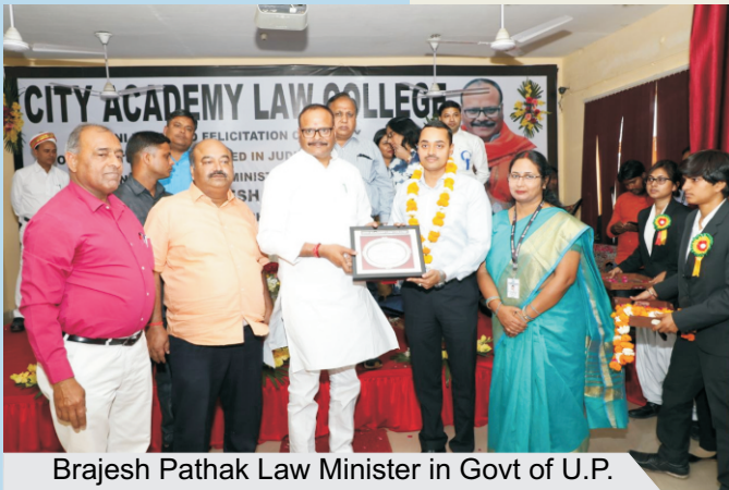
Brajesh Pathak Law Minister in Govt of U.P.